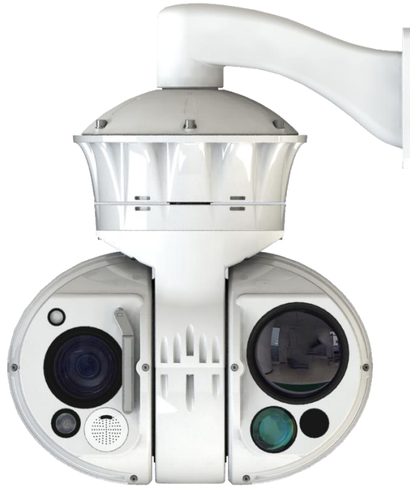
Camera picture for reference only.