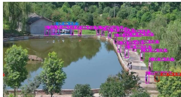
Multi-target recognition/ranging of people, vehicles and animals