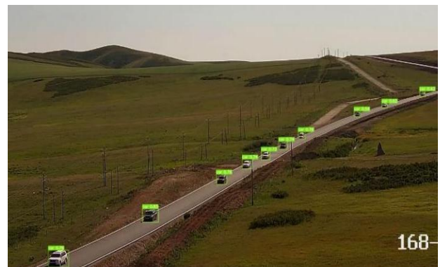
Human vehicle classification identification